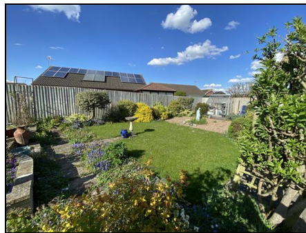
Further Garden Aspect