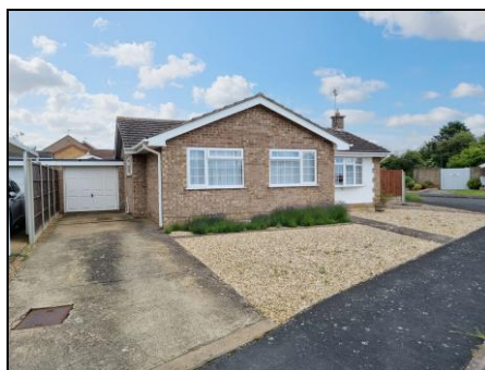
Further Front Aspect