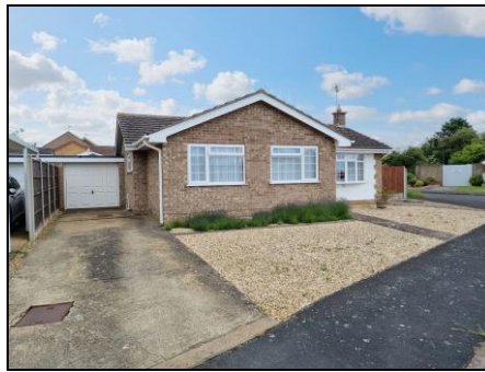
Further Front Aspect